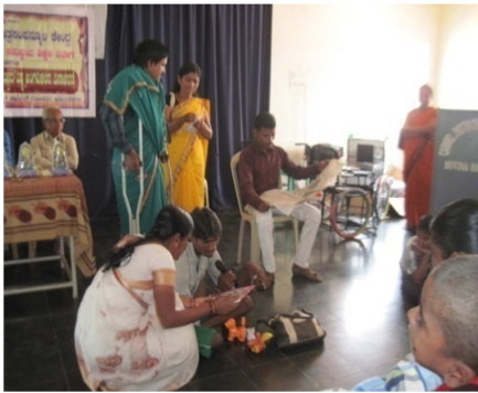
Skit by PWD & PAL